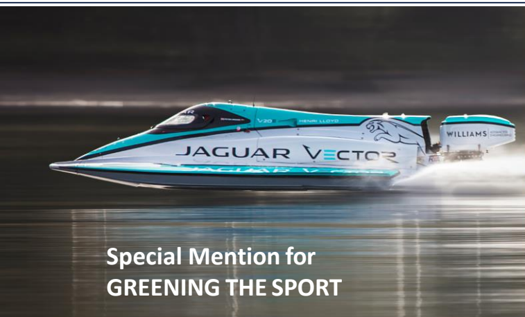
Special Mention for GREENING THE SPORT