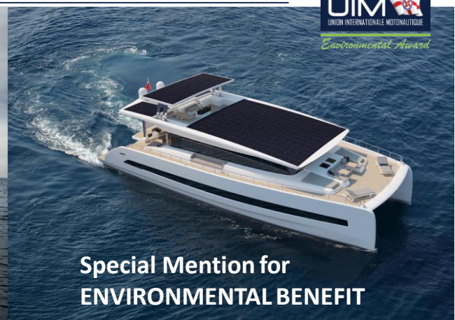
Special Mention for ENVIRONMENTAL BENEFIT